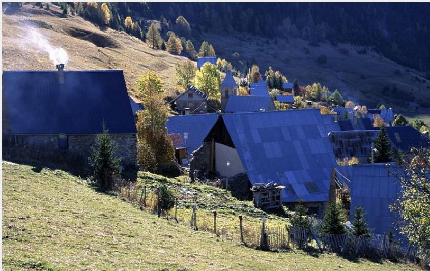
Villard-Reymond (Denis Fiat - PNE)