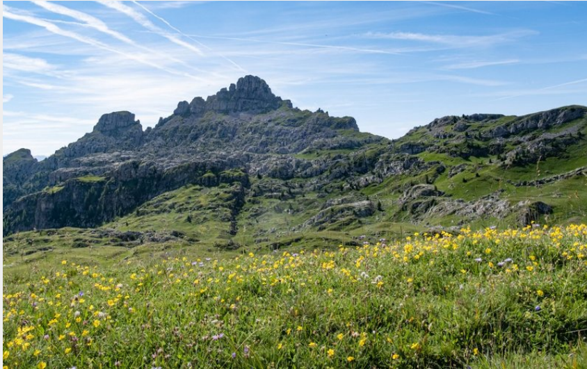
Les Aiguilles de Chabrières et l'Oucane (Mireille Coulon - Parc national des Ecrins)