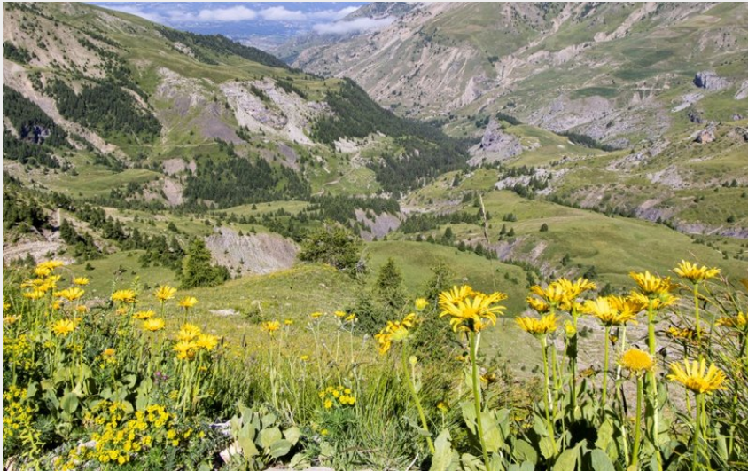
Vue depuis le col de la Coupa