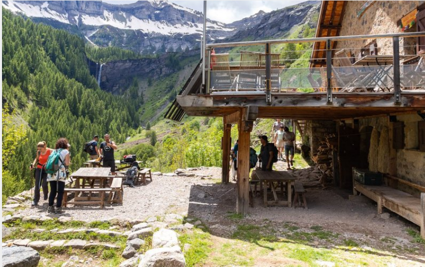
Refuge du Tourond