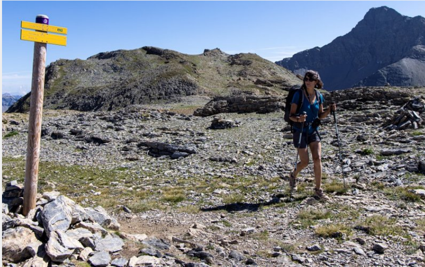
Le col des Terres Blanches