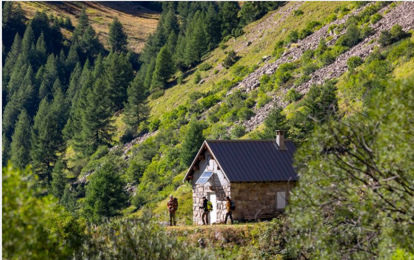
Cabane du Pré d'Antoni