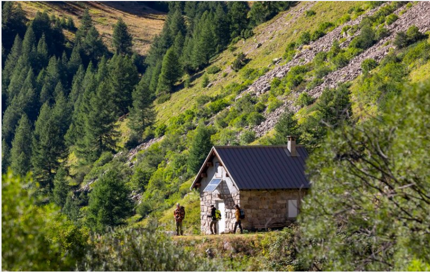
Cabane du Pré d'Antoni