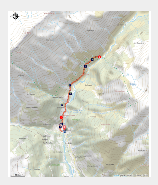
Chapelle Saint-Marcellin

A family walk, with many flowers at the end of Spring, which weaves along the edge of the slope to the chapel which is named after the first Bishop Embrun.