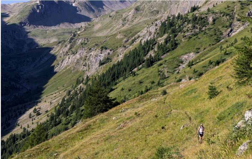
Montée au col des Tourettes (Thierry Maillet - Parc national des Ecrins)