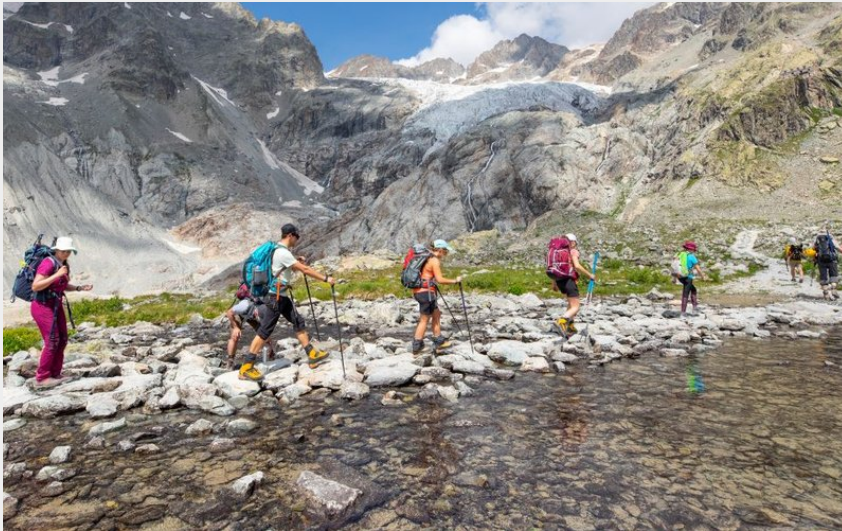
Glacier Blanc et Lac Tuckett approche (Thibaut Blais - Parc national des Ecrins)