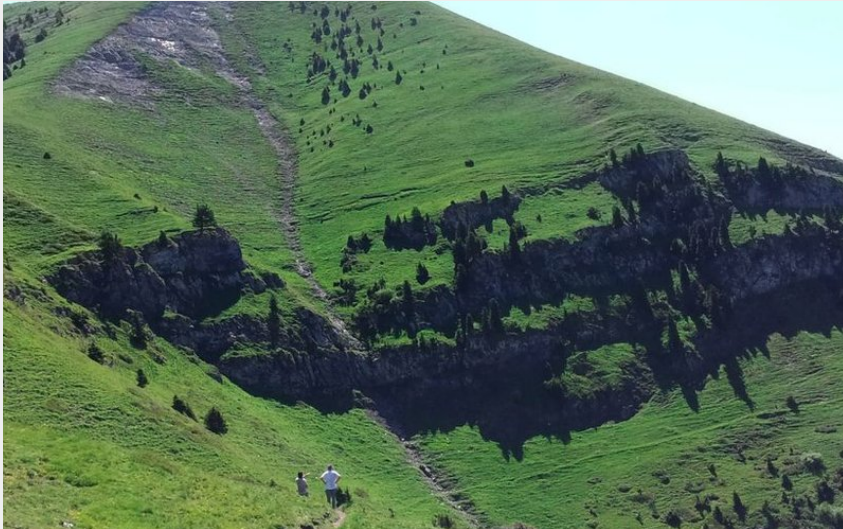
Vêt vu du Jas des Agneaux (Bernard Nicollet - PNE)