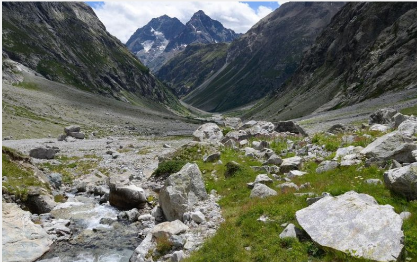
Autour du refuge du Châtelleret (Rodolphe Papet - PNE)