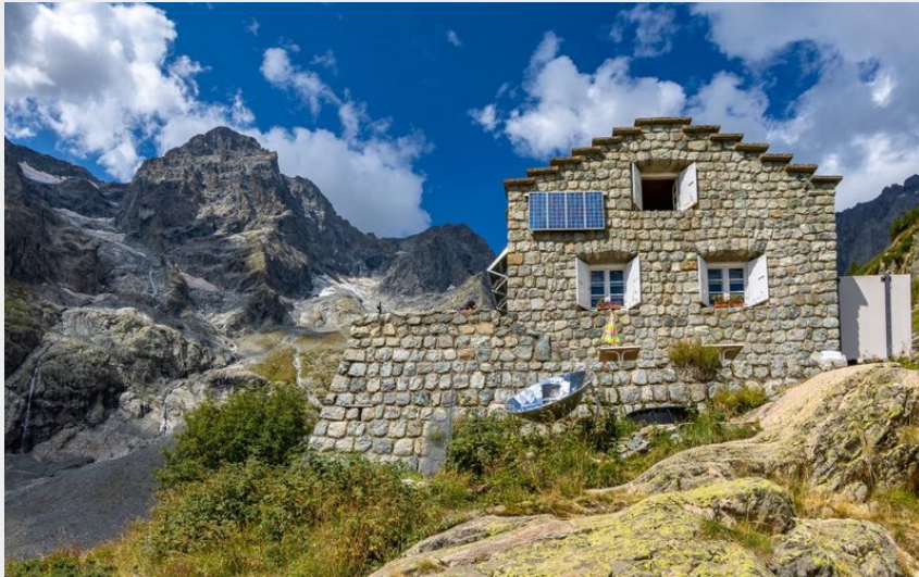
Refuge des Bans (Bertrand Bodin - Parc national des Ecrins)