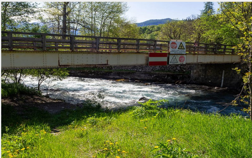
Débarquement Onde (Claude Margaux)