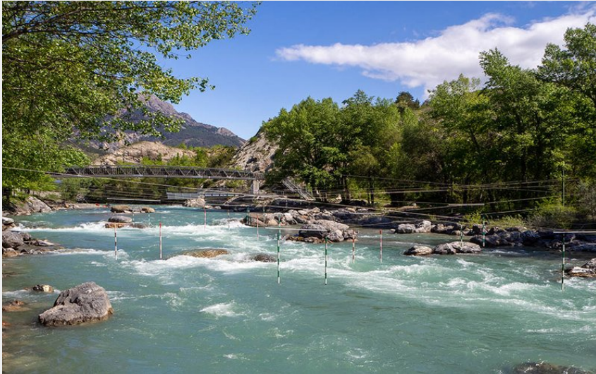
Gyrone P2 Débarquement 1 (Claude Margaux)