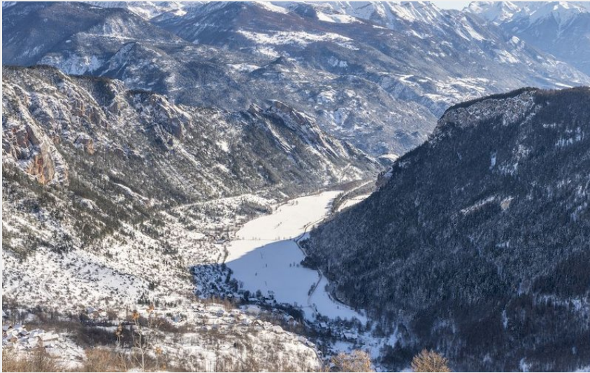
Panorama sur la plaine de Freissinières depuis l'itinéraire vers la Tête des Raisins