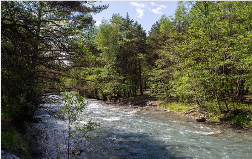
Biaysse P2 Débarquement (Claude Margaux)