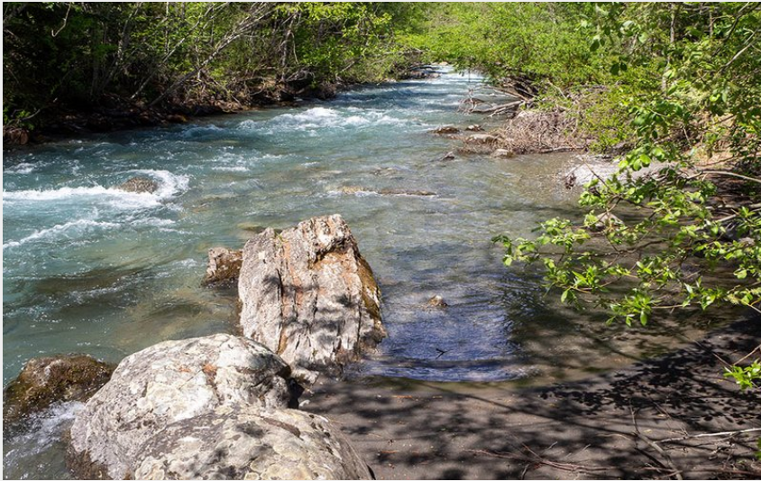
Biaysse P2 Embarquement (Claude Margaux)