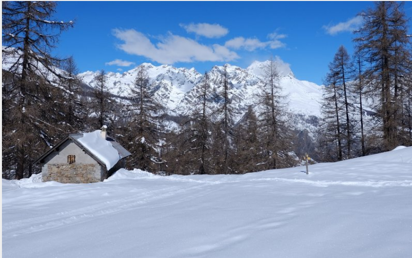
Cabane du Laus (Pierre Nossereau)