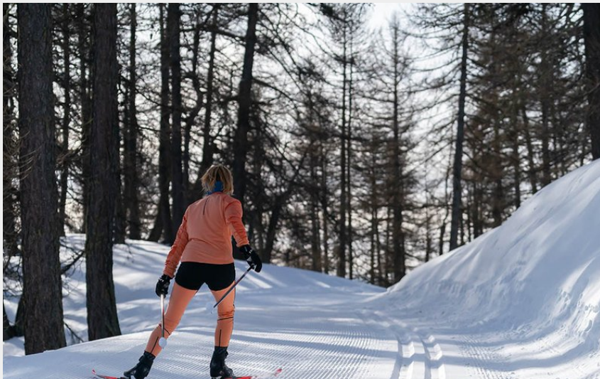
Piste n°4 : Les Grandes Têtes (Rogier Van Rijn)