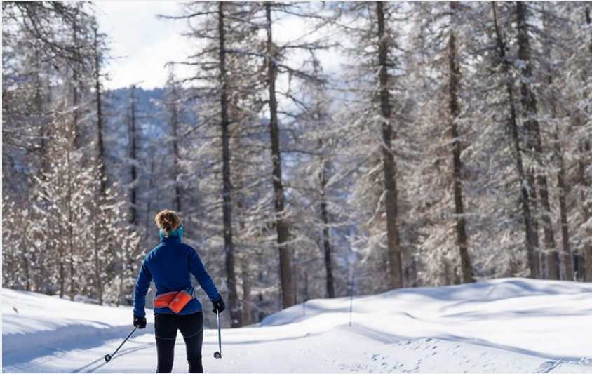
Piste n°2 : Tour de la Pousterle (Rogier Van Rijn)