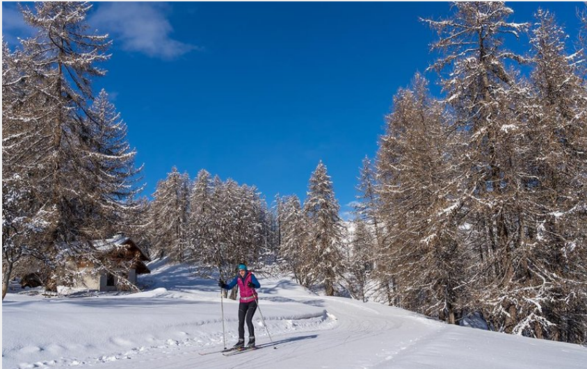
Piste n°1 : Tournoux - La Rochaille (Rogier Van Rijn)